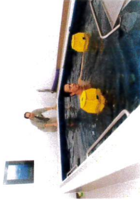
1. Kittanning Facility 11931 State Route 85 (intersection of Rt 85 and Rt 28/66) 724-543-1627