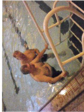
3. Allegheny Valley YMCA 5021 Freepoint Road Natrona Heights 724-224-2718