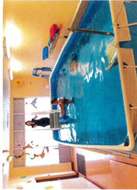
2. Vandergrift Facility 111 Sherman Avenue (near Vandergrift Bridge) 724-567-2265